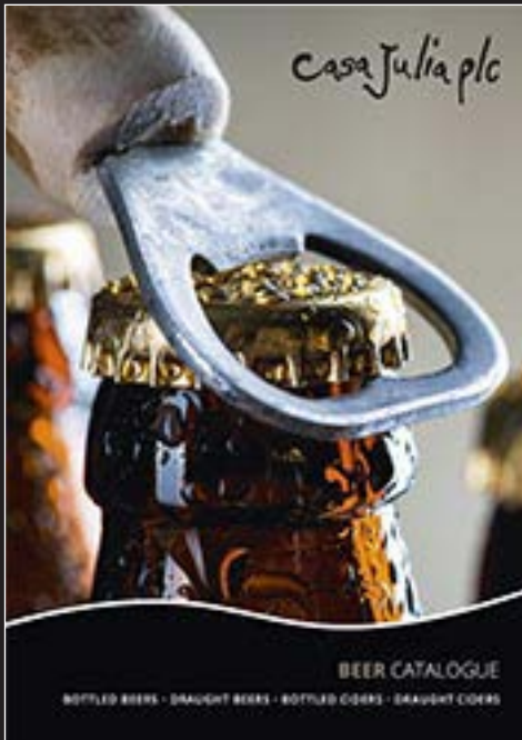
BEER & CIDER CATALOGUE

Our brochure range can be downloaded from our website: www.casajulia.co.uk/download-brochures