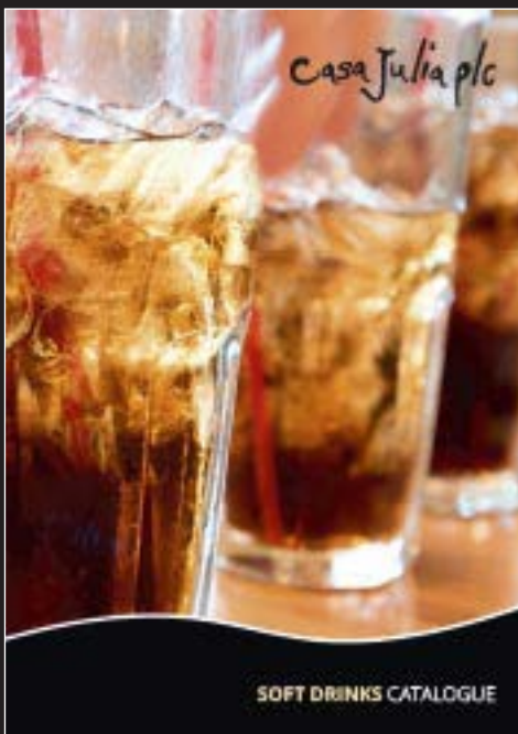
SOFT DRINKS CATALOGUE